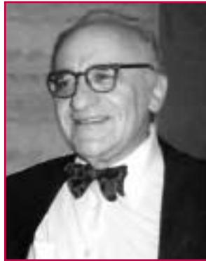
Murray N. Rothbard

I agreed with Rothbard: I would like to see the government completely eliminated. Of course I understand the practical problems, as did Mises. We’ll never get a world without government—but I believe we must organize and maintain a strong antigovernment movement simply to keep the beast in its cage.