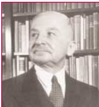
Ludwig von Mises

Mises could do no other than present the truth as he saw it. We loved that about him. He was a man to admire.