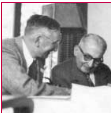
F.A. Hayek and Ludwig von Mises

I would like to suggest that, after all, are we not all dealers in secondhand ideas—going back perhaps as far as Aristotle?